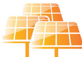
To learn more about cooperative solar projects and how cooperative principles enhance such projects, please visit http://www.nreca.coop/wp-content/plugins/nreca-interactive-maps/esri-solar-story-map/index.html

Additional details concerning enrollment in the solar project, including rates and possible discounts for participation, will be published in Country Living as the information becomes available. Please watch your newsletter for more details.