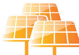
To learn more about cooperative solar projects and how cooperative principles enhance such projects, please visit http://www.nreca.coop/wp-content/plugins/nreca-interactive-maps/esri-solar-story-map/index.html

Additional details concerning enrollment in the solar project, including rates and possible discounts for participation, will be published in Country Living as the information becomes available. Please watch your newsletter for more details.