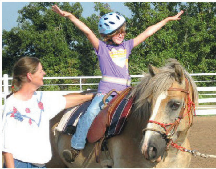
Operation Roundup helps programs such as the Right Path Riding Academy help others. The Drumright-based academy provides therapeutic riding programs for special needs adults and children.

Operation Roundup celebrates a decade of local giving